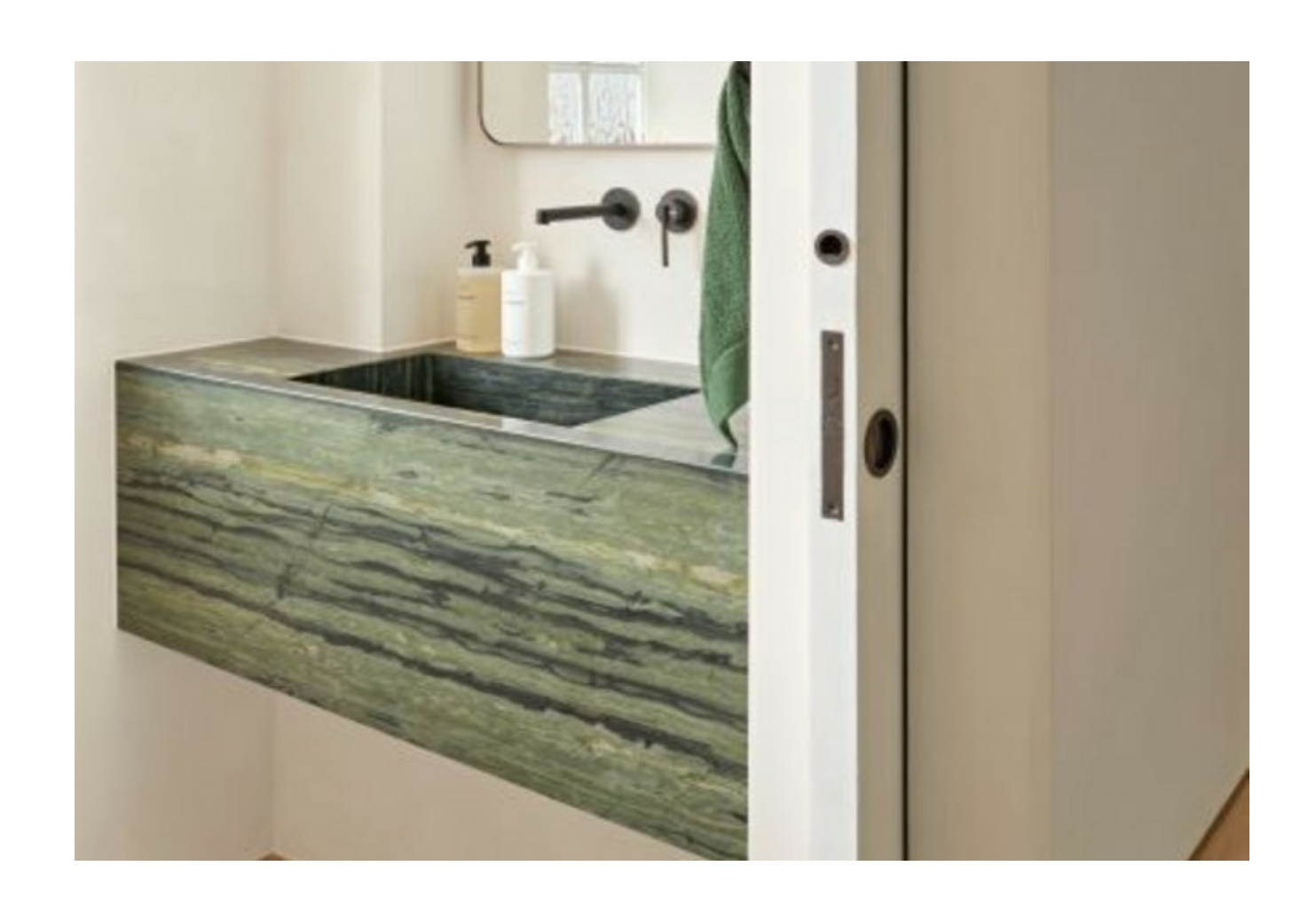
An immaculately refurbished apartment on the 5th floor of this well regarded portered block in Mayfair.