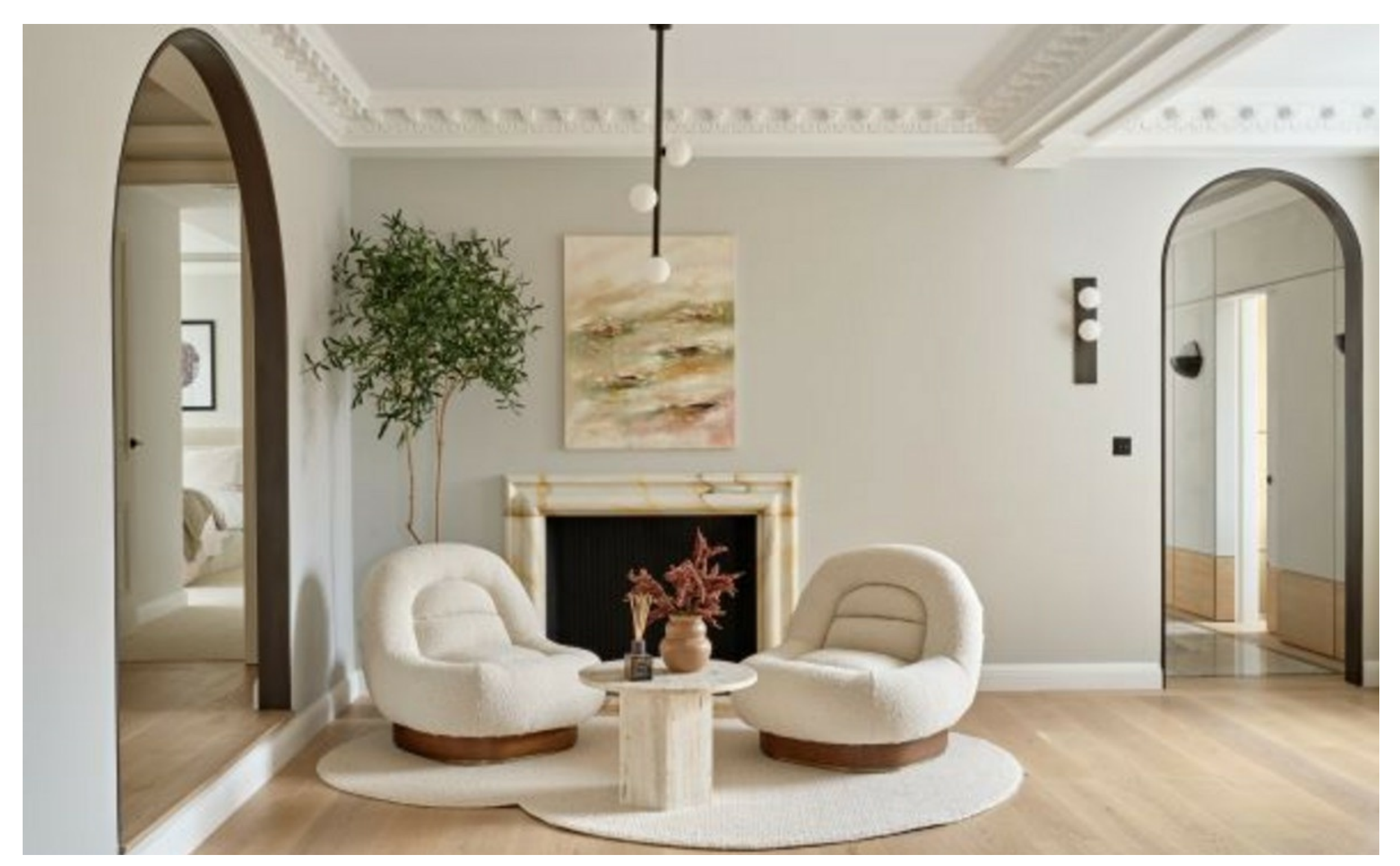
Park Street, London, W1K 7 Guide Price £10,500,000